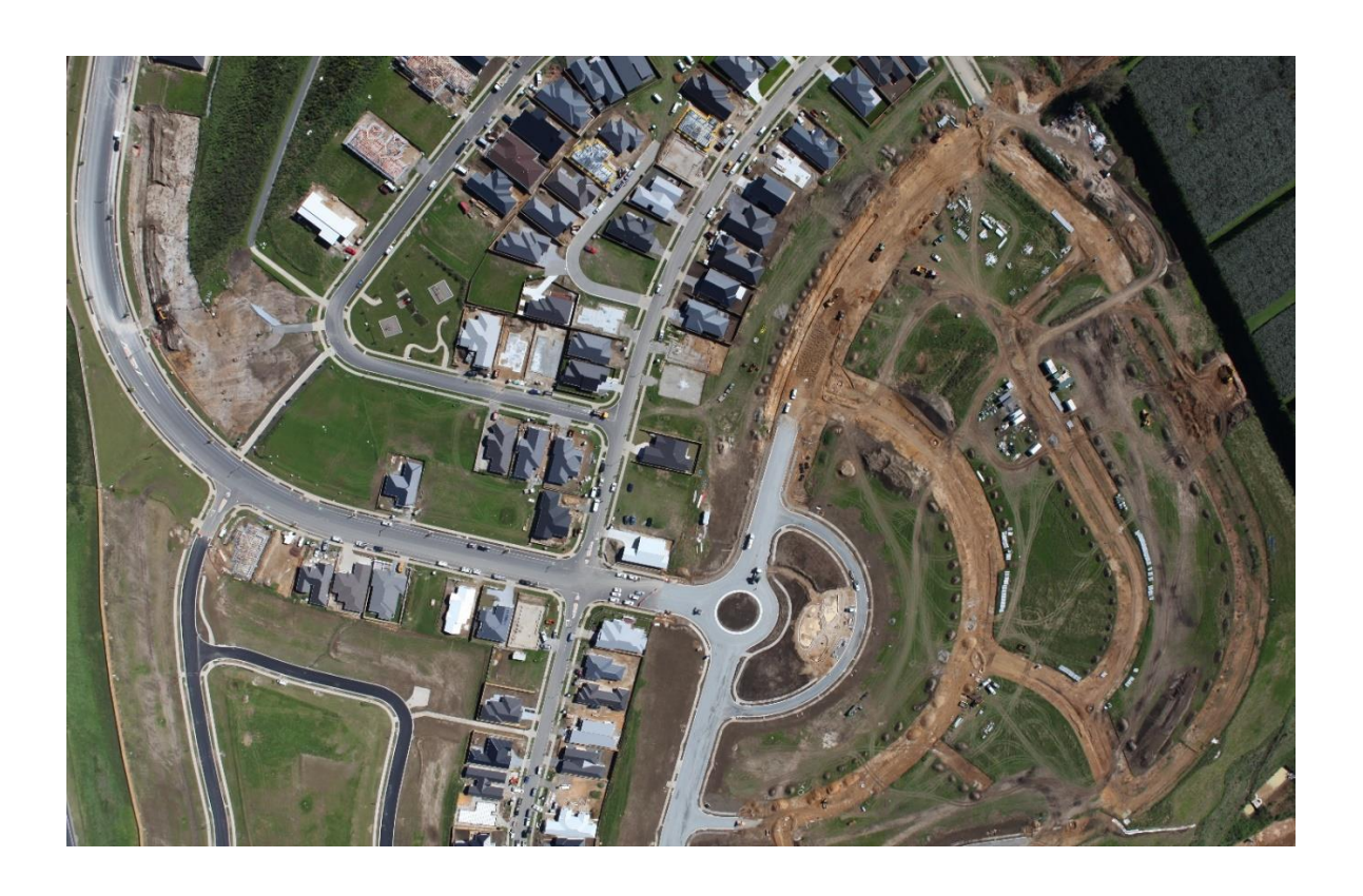
(b) 9 August 2016